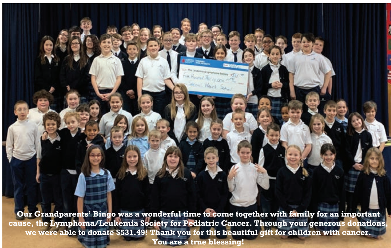
Our Grandparents' Bingo was a wonderful time to come together with family for an important cause, the Lymphoma/Leukemia Society for Pediatric Cancer. Through your generous donations, we were able to donate $531.49! Thank you for this beautiful gift for children with cancer. You are a true blessing!

Wednesday, April 1 – Berks Catholic High School, Reading, PA