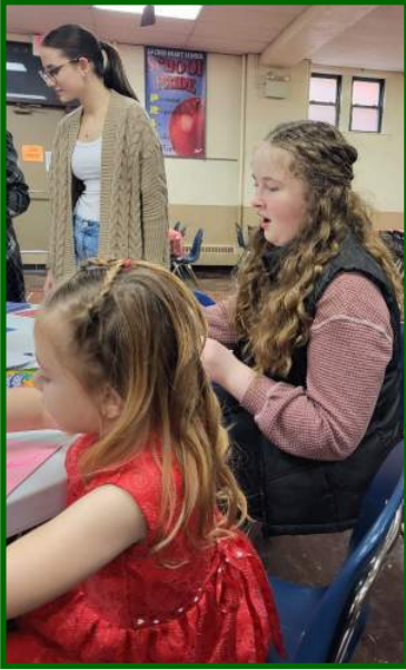
Pictures from the Children's Christmas Party at Sacred Heart of Jesus on Sunday, December 8th. The party was sponsored by the Knights of Columbus and over 20 children and their families participated!